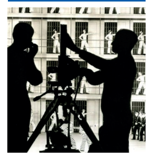
Monday 24 June, 7.00pm