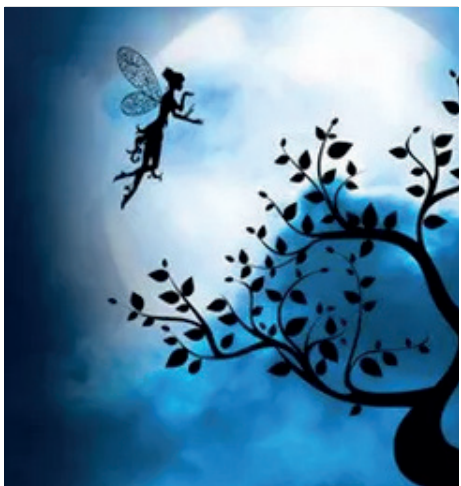
Wednesday 22 May & Thursday 23 May, 7.00pm