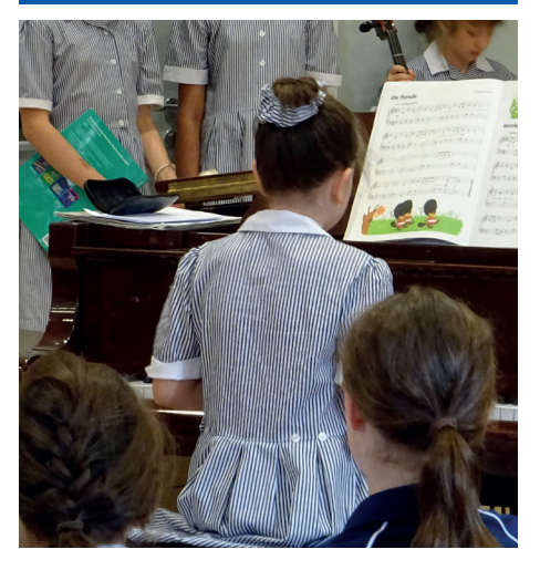
Tuesday 21 May, 3.00pm