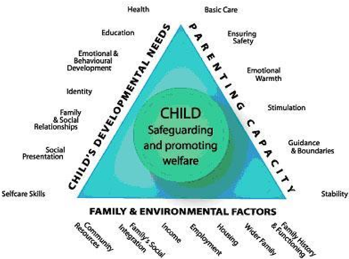
Figure 1 – The Assessment Framework 50